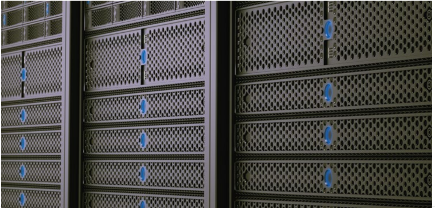
Fully functional CryptoSever Simulator available for evaluation and application integration.

The SecurityServer from Utimaco with tamper responding technology secures cryptographic key material for servers and applications. In combination with the CSe Series can be used for application and market segments with high physical security requirements e.g. Government Authorities, Banking environment,... The SecurityServer CSe is available as PCIe embedded card or as network attached appliance.